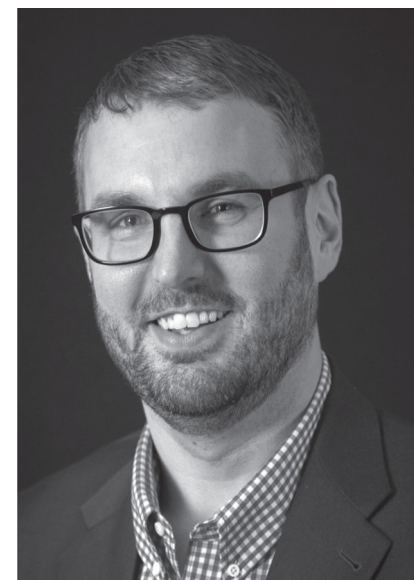
Macoupin County Clerk

From finalizing ballots and responding to vote-by-mail requests to setting up polling places and vote counting equipment, administering any election is a mammoth undertaking. As your County Clerk, it has again been my pleasure to work with staff members, party officials, candidates and public officials to make sure every aspect of the 2026 Primary Election runs smoothly.